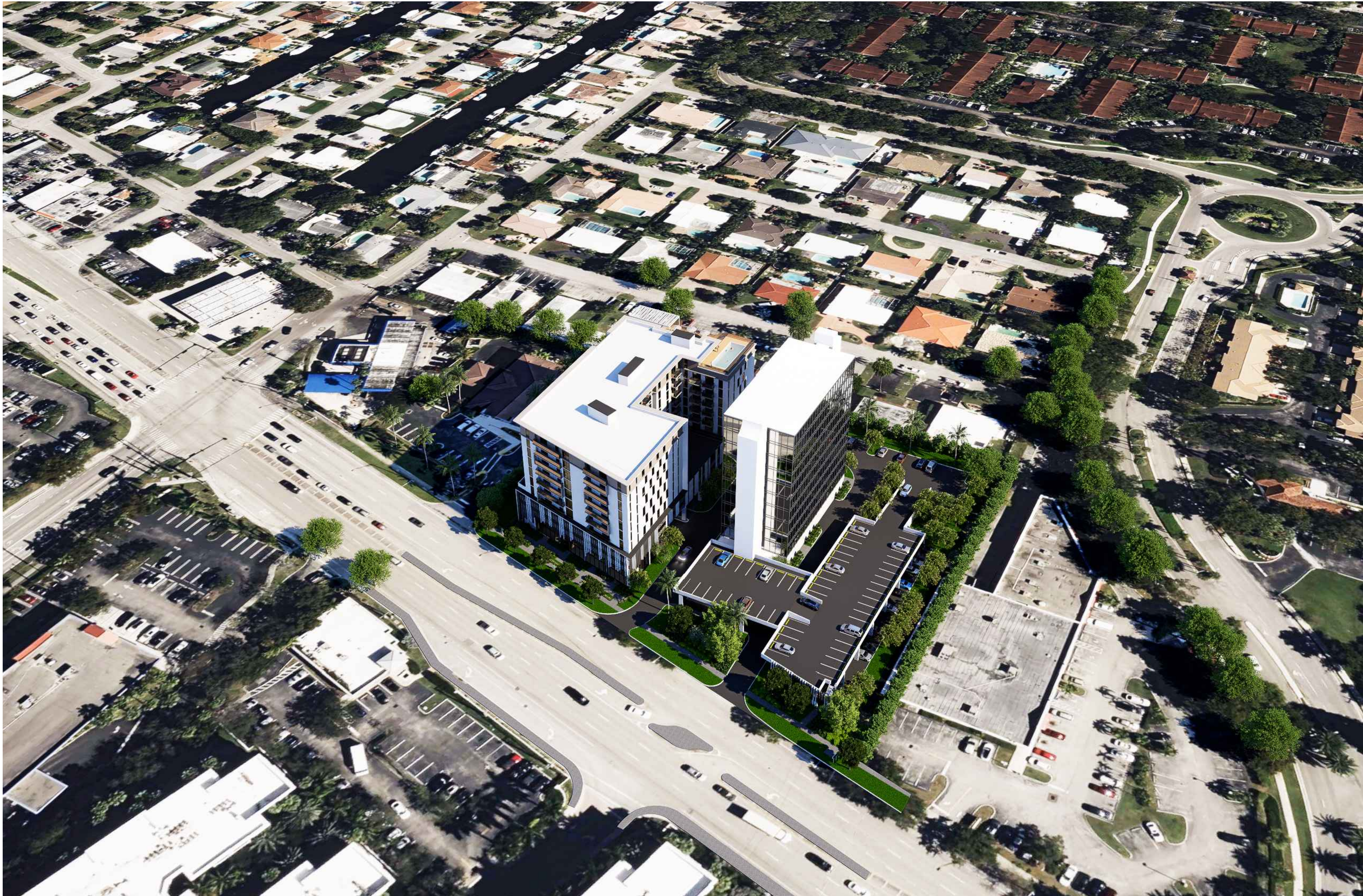
AREA VIEW LOOKING NORTH EAST